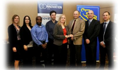
● ● ● The Mitomics Team

For more information about Mitomics, visit www.mitomicsinc.com